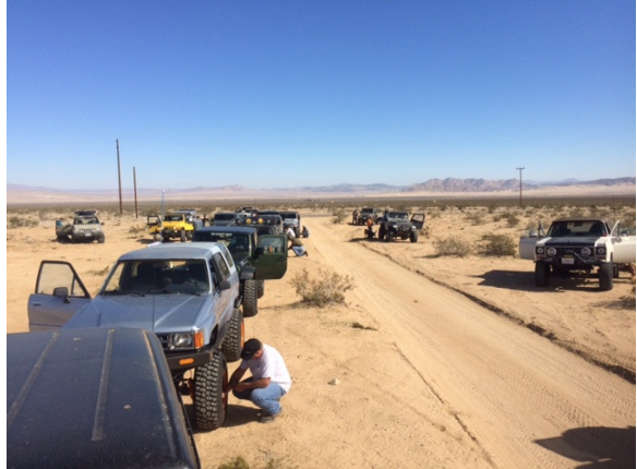
A beautiful sunny day to air down