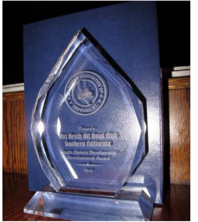
CAL 4 Wheel Drive, new member award